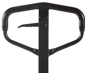
Rubber wrapped handle