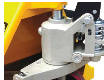
Integrated cast pump