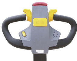
Frei tiller head (option)